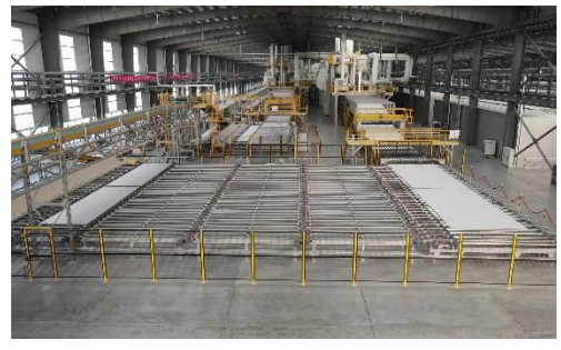
With an annual output totaling 120 million square meters, the company, headquartered in Chiping-Liaocheng, Shandong Province, makes an impressive entry into the plaster-board market.