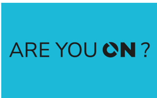
The company's slogan.