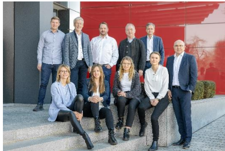
The team of Envelon in March of 2022.