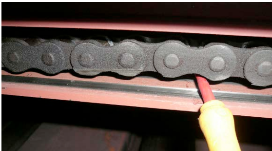
Old Version: Without Slide Bar (Worn)