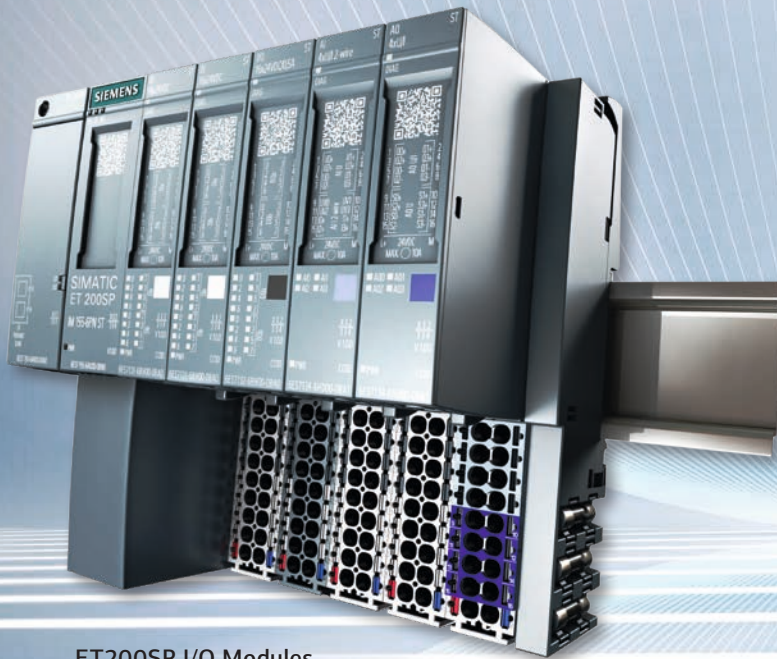
ET200SP I/O Modules