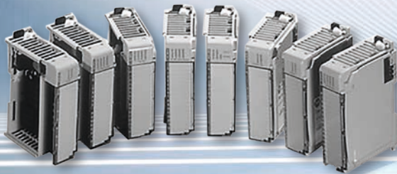
Compact Logix I/O Modules