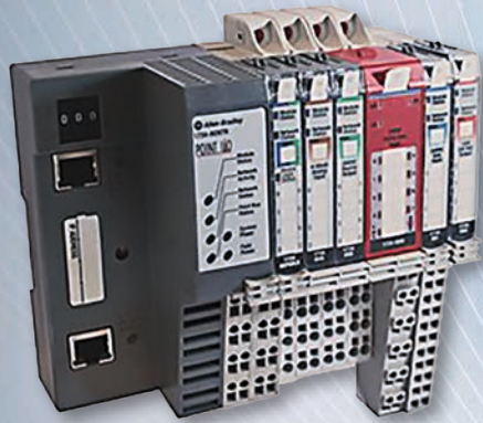
Point I/O Modules