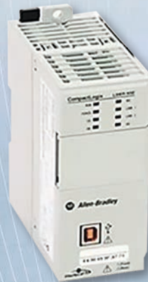
Compact Logix CPU