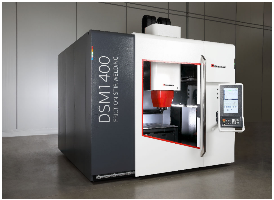
The compact 4-axis gantry machines of the DSM series (DSM = Dynamic Stirring Machine) stand for high axis dynamics, precise web guidance and intuitive control and operating concept.