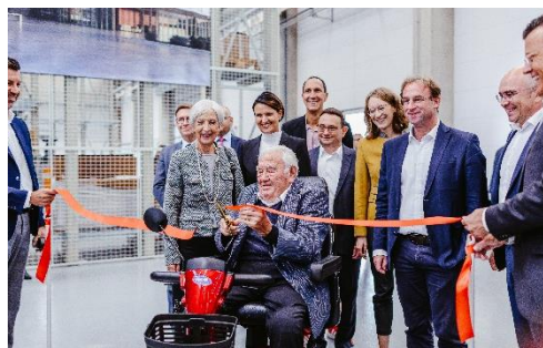
On the premises of Grenzebach's headquarter in Hammar, Bavaria, the company invests in a modern manufacturing plant to produce ENVELON modules.