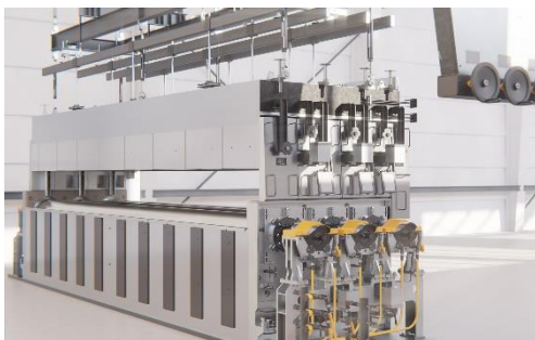
The innovative Grenzebach cross box offers motor-adjustable lift-out curve, optimized atmosphere separation and temperature distribution, and much more.